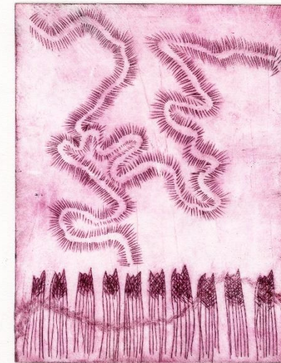
Top: Learning about Wurundjeri Country beside Merri Creek.