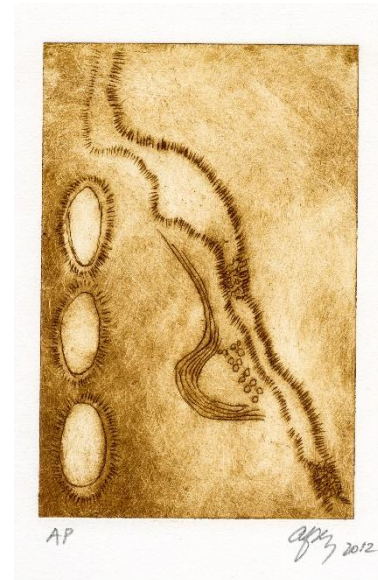
Shielded places (2012). Dry point etching. A. V. Foley