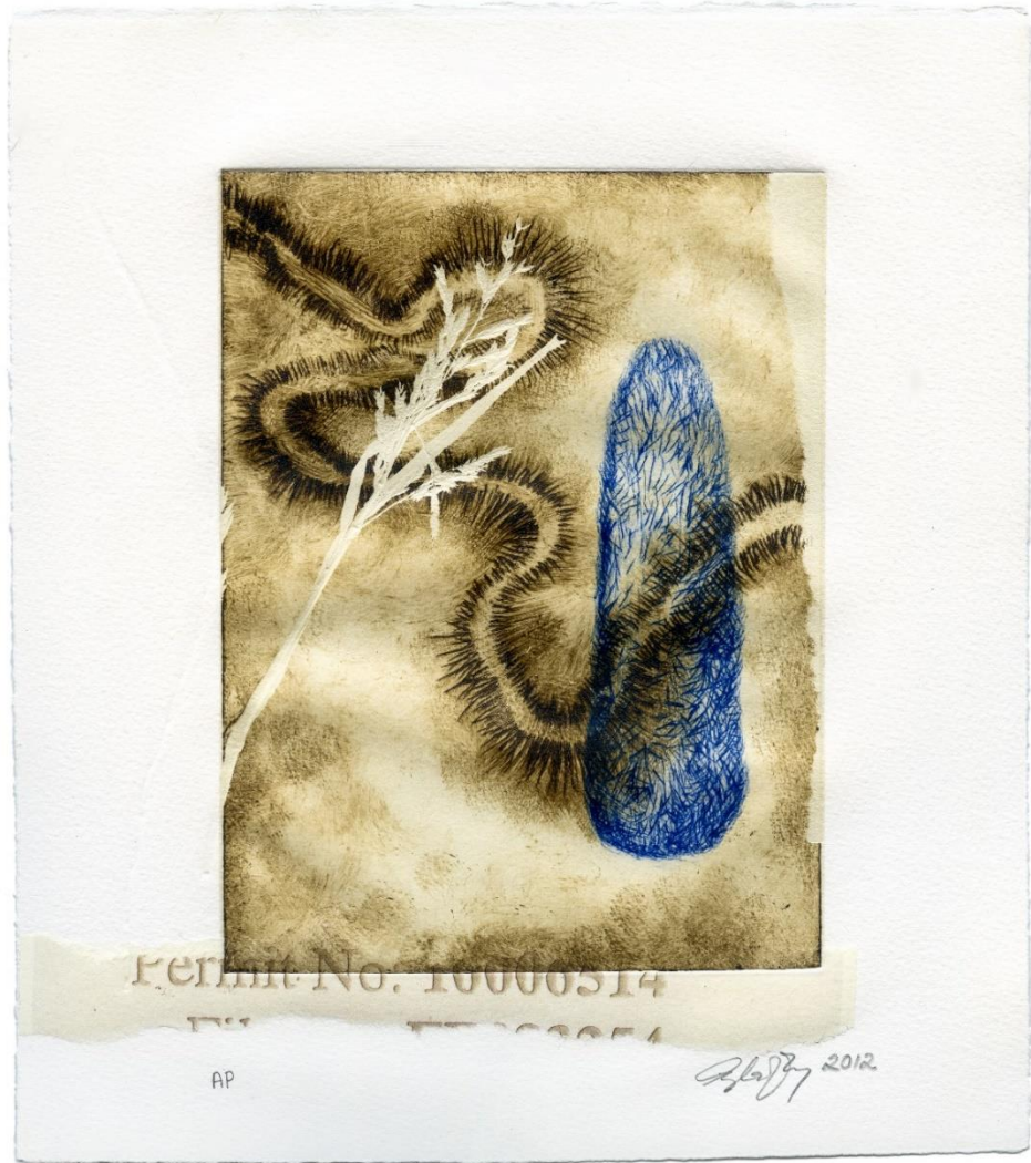
Writing from the ground up. Dry point etching with Chine Colle. A. V. Foley (2012)